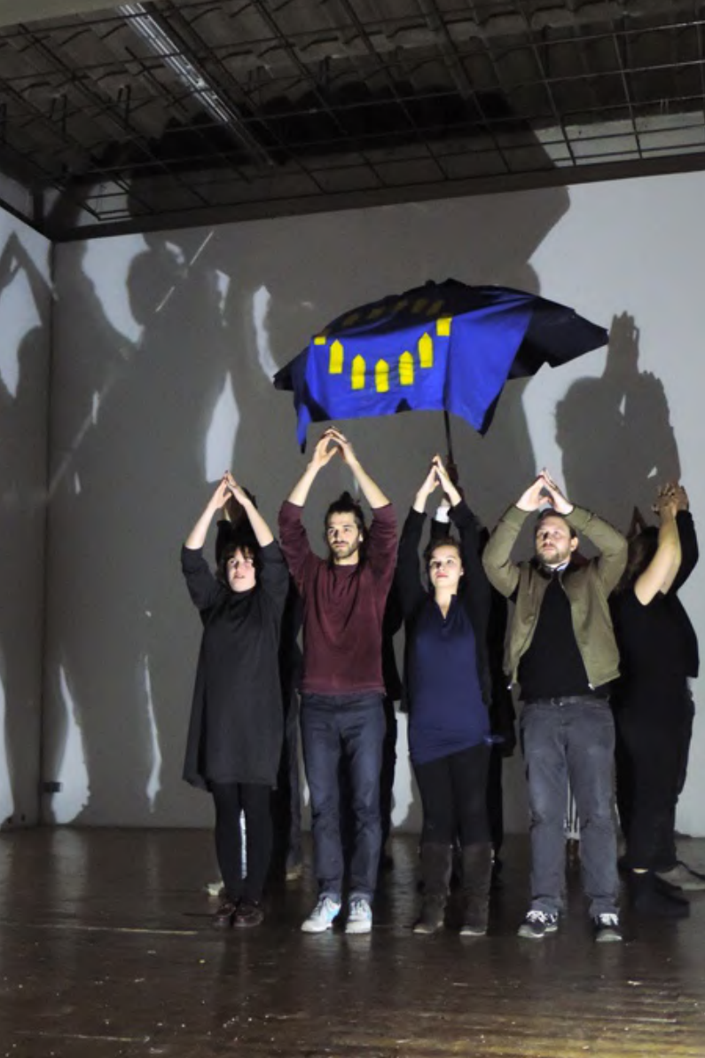
left: extract part III