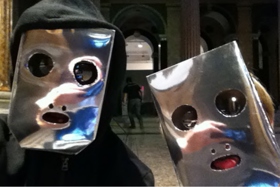
above: another selfie