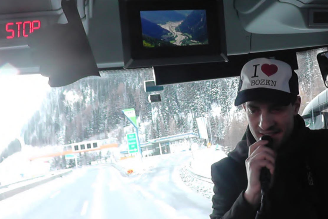
above: in the bus near Brenner